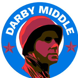
Alteration of logo color outside the palette