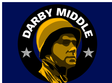
Placement of logo on backgrounds that impact visibility