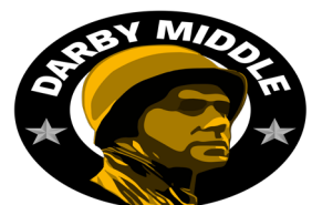
Stretching logo out of proportion